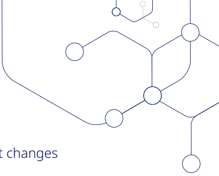
Chart Your Personal Weight History

People gain and lose weight differently over time. Please chart your history with weight changes and the events that were related to those changes.